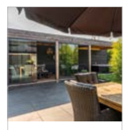
Fiano glass sliding doors