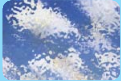
4. Rainwater hits window and sheets down glass