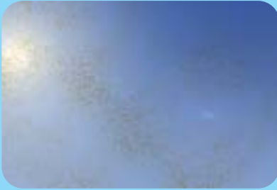
1. The window is exposed to daylight