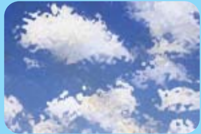
5. Dirt is washed away by rain