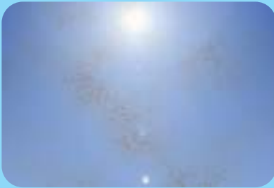
2. Daylight triggers the Pilkington Activ™ coating